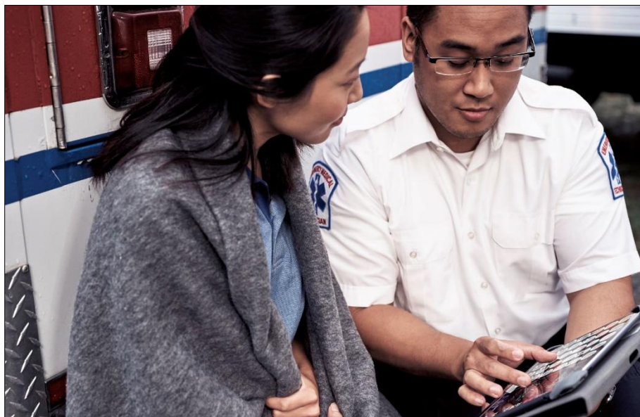
First responders and those who support them now have access to additional mission-centric applications and solutions

a mobile-first VPN solution that helps accelerate, optimize and secure mobile device traffic directly to the dedicated FirstNet network core , improving the user experience by providing resilient connectivity both inside and outside coverage areas. NetMotion is a leading mobile VPN solution that is highly adopted by public safety. FirstNet has expanded its relationship with NetMotion offering multiple ways for public safety to get access to a known solution that provides users a seamless mobile experience with the security and controls that agencies require.